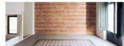
estudi nus > Rehabilitación de una vivie...