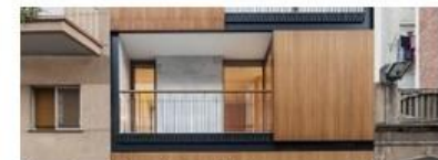
Alventosa Morell Arquitectes > Casa CP