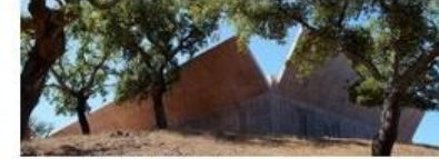
Valerio Olgiati > Villa Alem