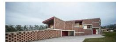
Laquila > Casa Bitxo