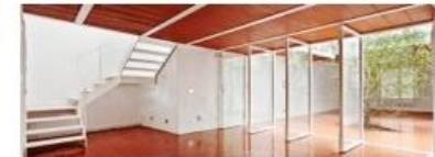
Arquitectura-G > Casa Luz