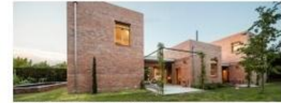
Harquitectes > Casa 1101